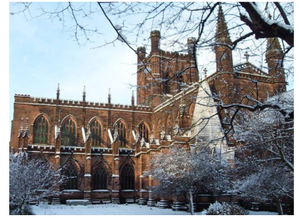
The design of the official 2010 Cathedral Christmas Card

It's that time of year again! It may seem a bit early to be starting your Christmas shopping, but the Cathedral Christmas cards are already in hot demand by visitors to the Shop.